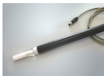
Tensiometer for the measurement of soil water potential