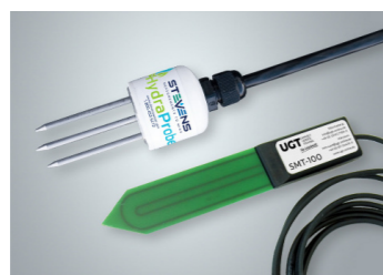
HydraProbe (soil moisture, temperature, conductivity); SMT-100 (soil moisture, temperature)