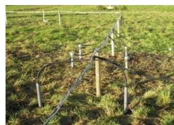
Conception and installation of soil hydrological measuring stations

-> Give conclusions on water transport, water storage capacity, sediment contamination